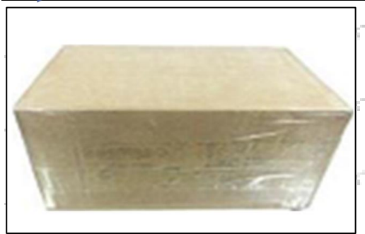
Pic No. 2 Domestic express packaging: Wrapped with Transparent tape